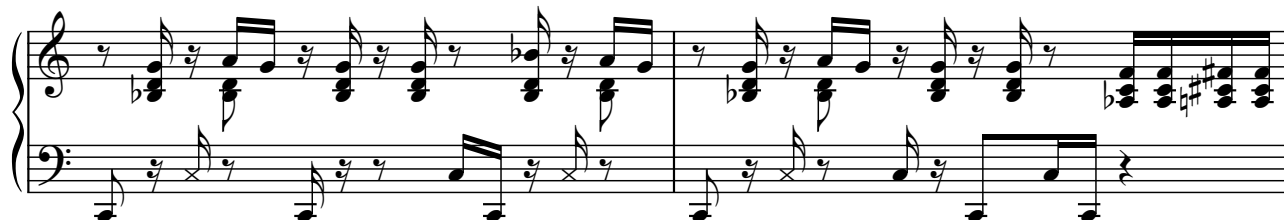
Lick G "JB-voicings"