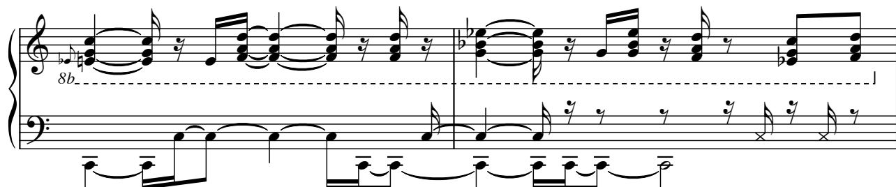
Lick I "Dominant seven & Sus"